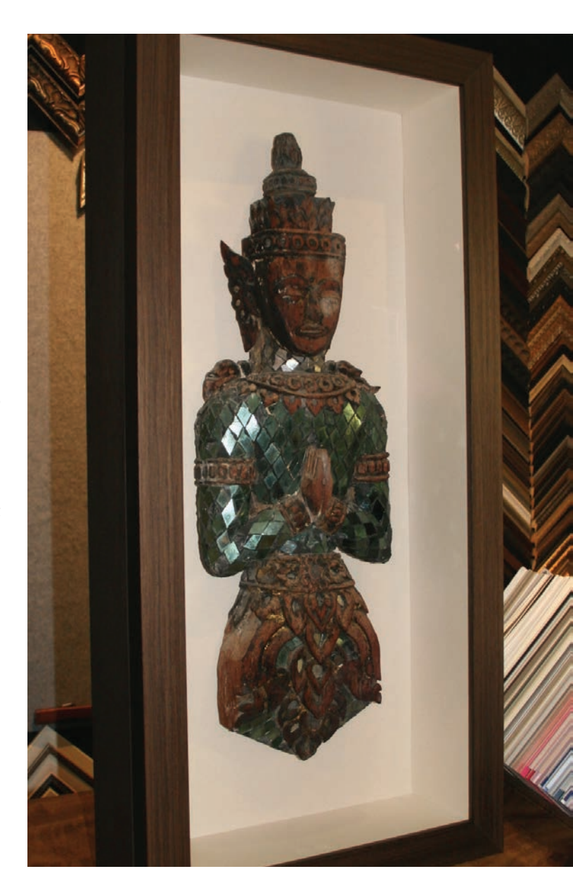
Box framing technique for 3D artworks

Sculptures and other 3D works need to be set back in box framing. There are ways to mount such pieces without using screws or glue that cause permanent damage. Always ask your framer about mounting techniques to ensure that your piece is not damaged in the process.