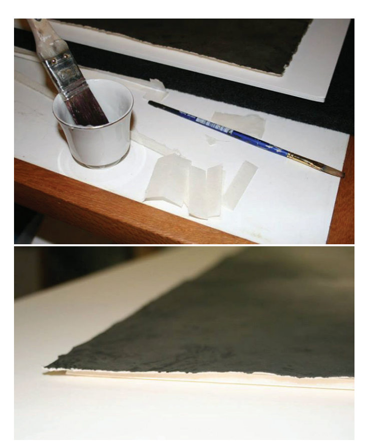
Japanese hinging mounting technique

The best method for conservation mounting works on paper is Japanese hinging - made from Japanese mulberry paper and handmade wheat starch paste. Other options include Mylar acrylic mounting corners or strips. Check with your framer as to which method is best suited to your work and budget. If your work is fabric or canvas, other conservation mounting techniques are available.