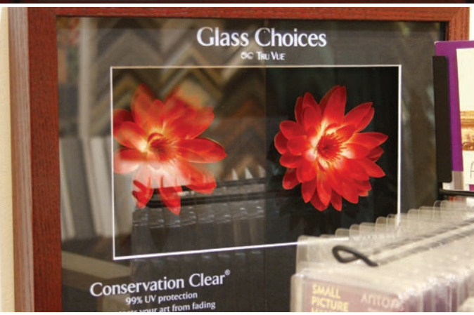
TruVue conservation glass range